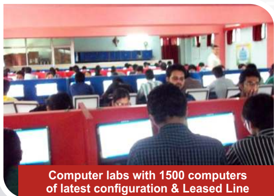
Computer labs with 1500 computers of latest configuration & Leased Line