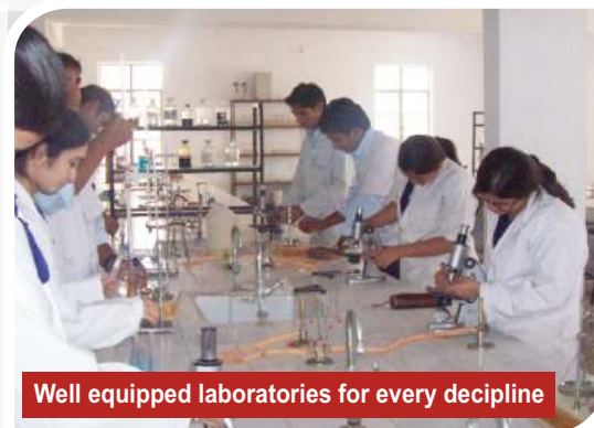
Well equipped laboratories for every decipline