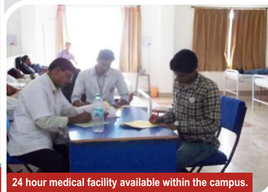
24 hour medical facility available within the campus.