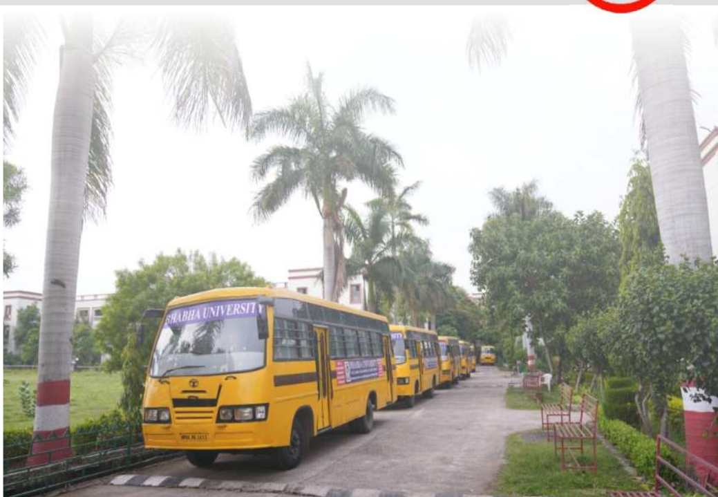
A fleet of comfortable Buses available from every corner of the city